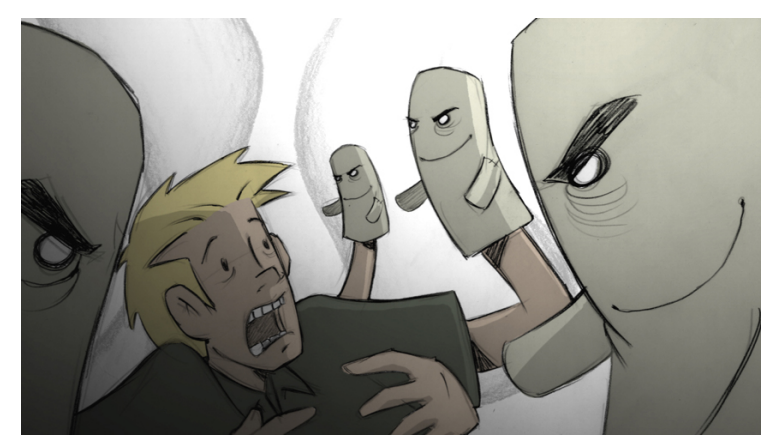
Fig. 2 - Image from the short film "Puppet" by animator Pat Smith of Blend Films

drawn lines as part of his final product<sup>4</sup> (Fig. 2). This approach was explored in the drawings for Teratorn. Clean, precious lines were used for the key frame drawings, while the inbetweens were allowed to maintain a loose line type. This decision began to form a style which shaped the rest of the film. By allowing the rough work to show in the inbetweens, the drawing process is seen in the final film. A question which this style brought to the forefront was whether or not the illusion of life could be achieved. By studying Smith's films and comparing to the Disney movies, it became clear that it is not the style of the drawings which affects whether the illusion of life can be successful. The larger factor at play was the precision and nuances in the motions being drawn. Although a consistent drawing style is important, the animators knowledge of what is being drawn is essential in obtaining the illusion. A performance by the animator is key<sup>5</sup>. Like an actor, it is necessary to fully embrace the role and understand every aspect of the character being portrayed.