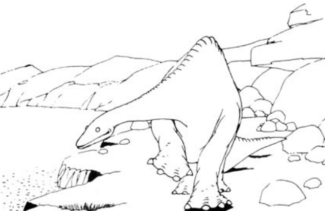
Fig. 1b - A frame from Gertie the Dinosaur