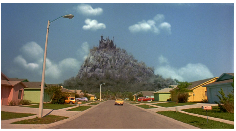
Fig. 4 - The village from Edward Scissor Hands was an inspiration for the style of Teratorn

is tested with storyboards. These are reworked until the story is complete. It is at this point that the style of the film must be decided. Inspiration was drawn from Tim Burton's movie Edward Scissor Hands. The monotonous design of the suburban neighborhood is juxtaposed by the eerie castle (Fig. 4). The essence of this town is implied with the feeling that not everything is as "perfect" as the residences portray. In Teratorn the simple and familiar act of scaring a bird, forcing it to flight is juxtaposed by a role reversal, with the appearance of the giant bird. The world is no longer an ideal, monotonous town and everything is forced into a fantasy world. The giant bird brings havoc to what otherwise seems like a normal area. As part of this process an animatic was developed to further test the timing of the film. An animatic allows all the actions, timing and layouts of the film to be seem in a rough state before any animation is done<sup>7</sup>. Throughout these early stages of design, a balance between creating a specific style and the fantasy worlds must be met with thoroughly developing the exact movements of the character to ensure that they are as fluid as possible to maintain a believable performance.