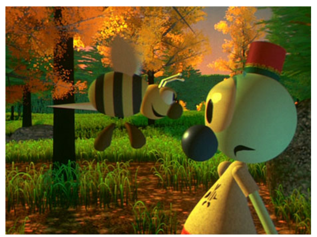
Fig. 3 - Andre and Wally B, an early computer animated short by John Lasseter at Pixar Animation Studio

character animation program (and currently the chief executive officer for Pixar and Disney Animation Studios), who had the vision to integrate the new computer technologies with tradition animation subject matter. His early tests, such as Andre and Wally B (Fig. 3) use the restrictions due to the lack of computing power to create the stylistic approach. With only using basic shapes, the characters and scenes could be fully formed. As a result of Lasseter's formal training, he insists that it is not the method in which the film is made which makes it good, but rather the story being told<sup>6</sup>. This mix of computer programmers and animators at Pixar in the 1980's opened up the entertainment field for computer generated films. This shift in thinking about the new technology gave animators the chance to incorporate their traditional methods into the new tool. This development of the Pixar studio shows how it is not the medium or tools used to create an animation that has an effect on the illusion of life, but rather the animators understanding of there subject matter.